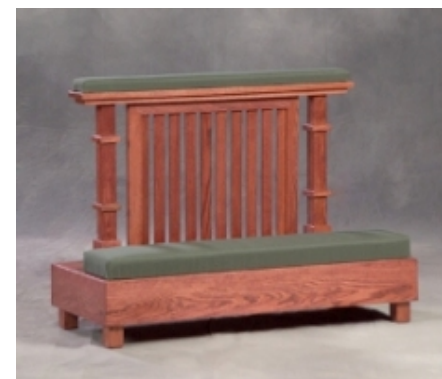
shown with Mission Slats

Our ruby vigil glasses are handcrafted using red glass. The metal fitters are custom crafted in prairie style. These candles are designed for use at the head and foot of the casket. They can be wired for electric "flicker-flame" candles. The paschal candle can also be made, using a shorter candlestick. These are available in all the woods and stain colors. 46" tall (to bottom of vigil glass) on a 12" x 12" base