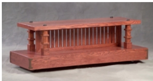
shown with Mission Slats

These lamps are truly unique for the industry, using the prairie style stained glass shades, which are handcrafted in our own shop. The base color of the shades is very close to the color of the commercially produced torchiere bowls. This allows the cosmetic light from our pink-neck Duro-Test bulbs to work for you. The hardware which holds the shades, is custom crafted in prairie style. The lamps are available in all the woods and stain colors. 64 ¾" tall (to top of metal fitter) (bottom of shade), with a 15" x 15" base.