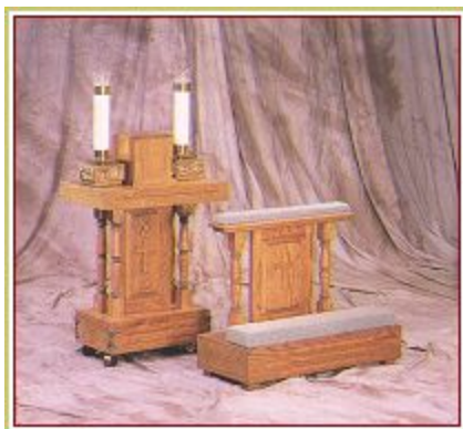
Baby Bier & Cremation Urn Stand and Mini-Prayer Rail