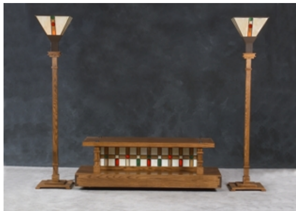
shown with Stained Glass