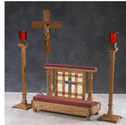
shown with Stained Glass

This prayer rail is shown with the optional handcrafted stained glass upright panel. Our stained glass panel has a cross, which is made using beveled glass, which has an elegant effect. Mission slats are standard for the upright panel. Both the arm and kneepads are upholstered for comfort. The base corners are accented with decorative metal corner protectors in the prairie style. It is available in all the woods and stain colors. 44" long x 18" deep x 32 1/4" tall