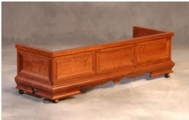
Queen Anne Design